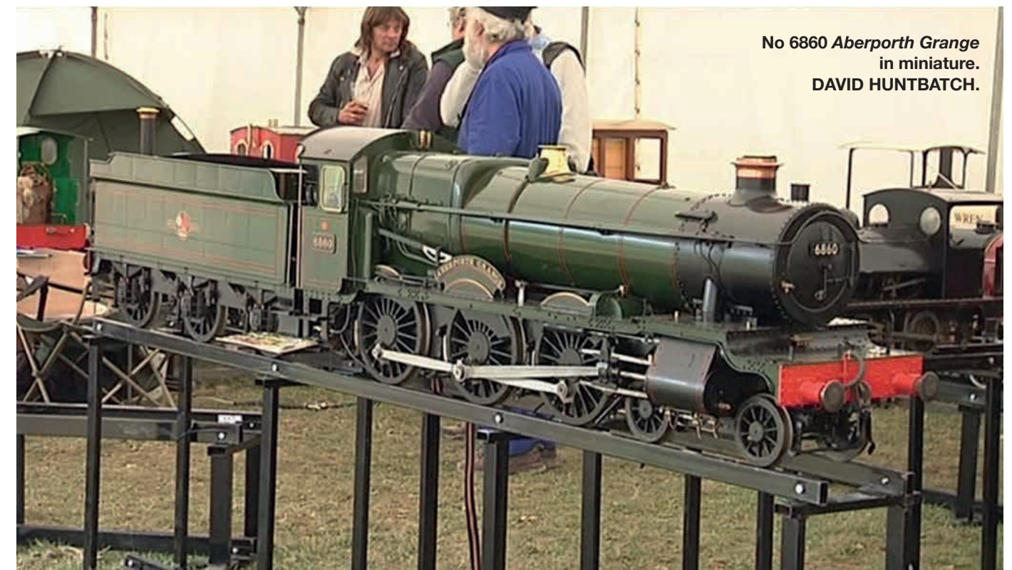
No 6860 Aberporth Grange in miniature. DAVID HUNTbatch.

The inspiration – ex-GWR 'Grange' Class 4-6-0 No. 6841 Marlas Grange has been well and truly burnished so that its Brunswick green livery looks almost black in the subdued lighting under Brunel's magnificent roof at London's Paddington station. It is in charge of the RCTS special 'The Gloucestershire Railtour' which it worked as far as Avonmouth Docks on Sunday July 21st, 1963. COURTESY GEOFF M PLUMB