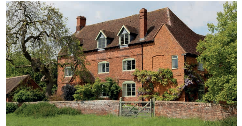
Betton Grange farmhouse as it is today.

The building has listed status and the various architectural changes that have occurred are documented and go back as far as the late 16th century. Known as Betton Strange Farmhouse for many years, previous owners have renamed it