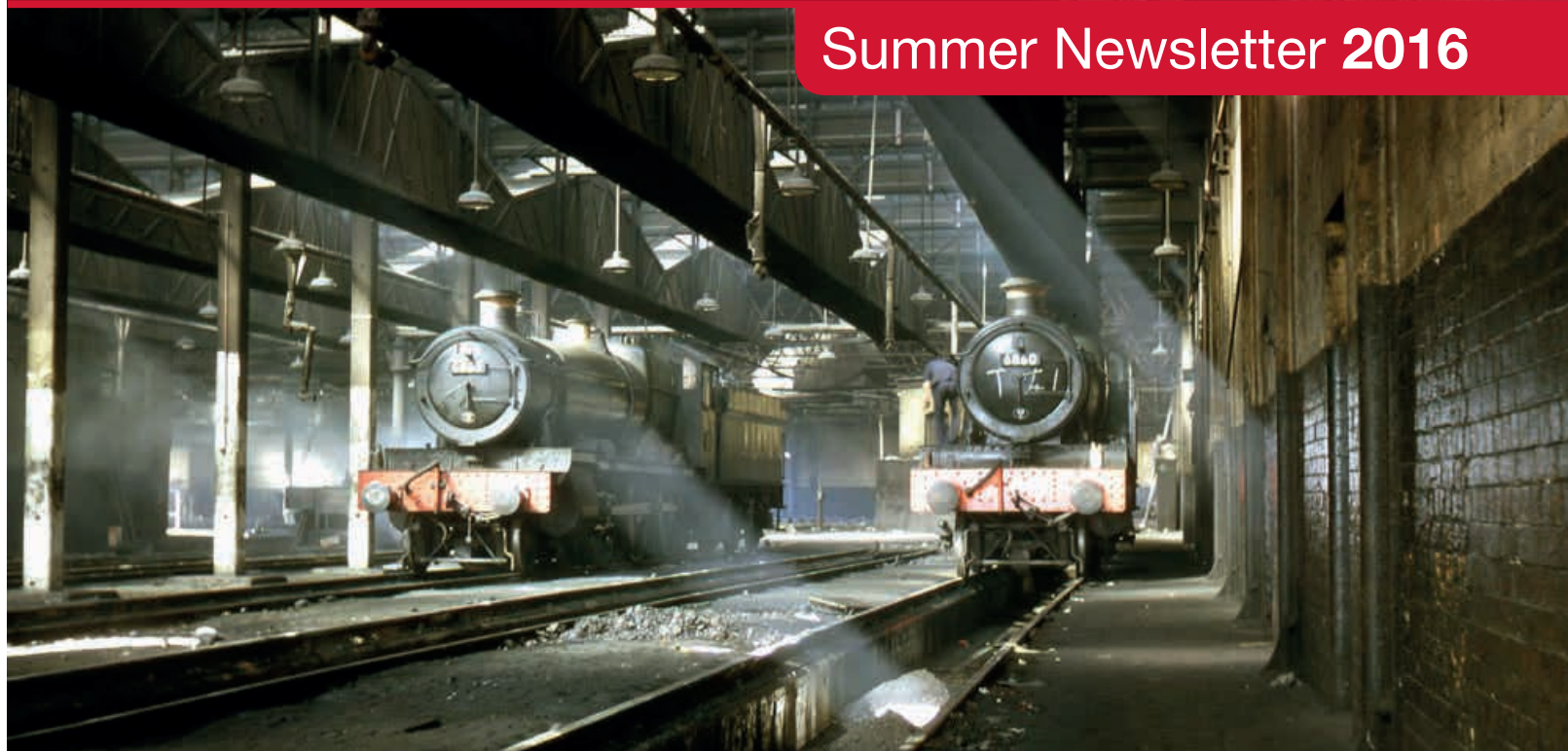
The end of steam at Cardiff Canton shed and two 'Grange' class 4-6-0s simmer in the empty gloom. Nos. 6853 Morehampton Grange (left) and 6860 Aberporth Grange were pictured by Alan Jarvis there on September 9th, 1962. COURTESY STEPHENSON LOCOMOTIVE SOC