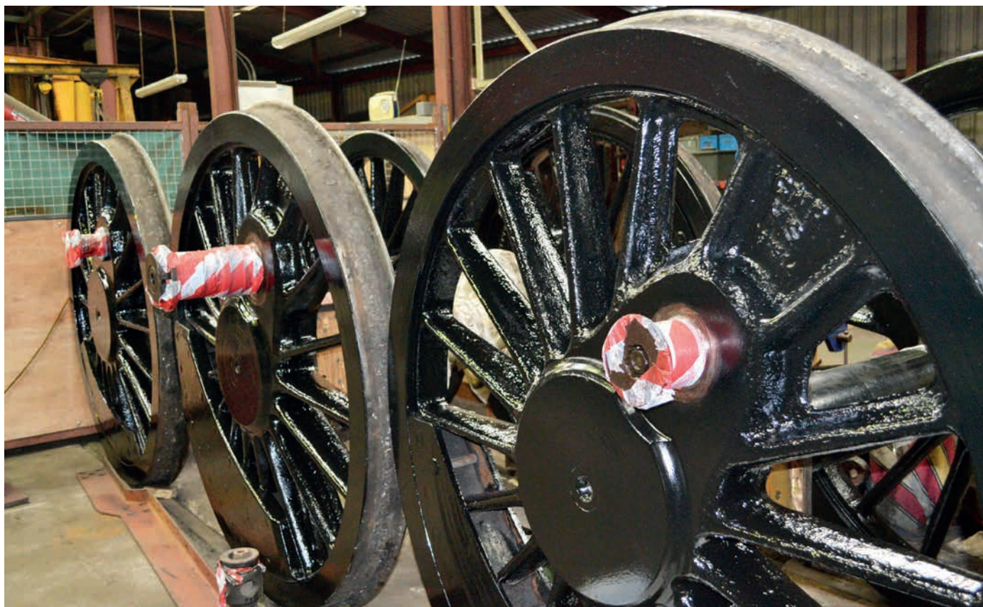
The opportunity has been taken to give the driving wheels a fresh coat of paint. LYNN MOORE