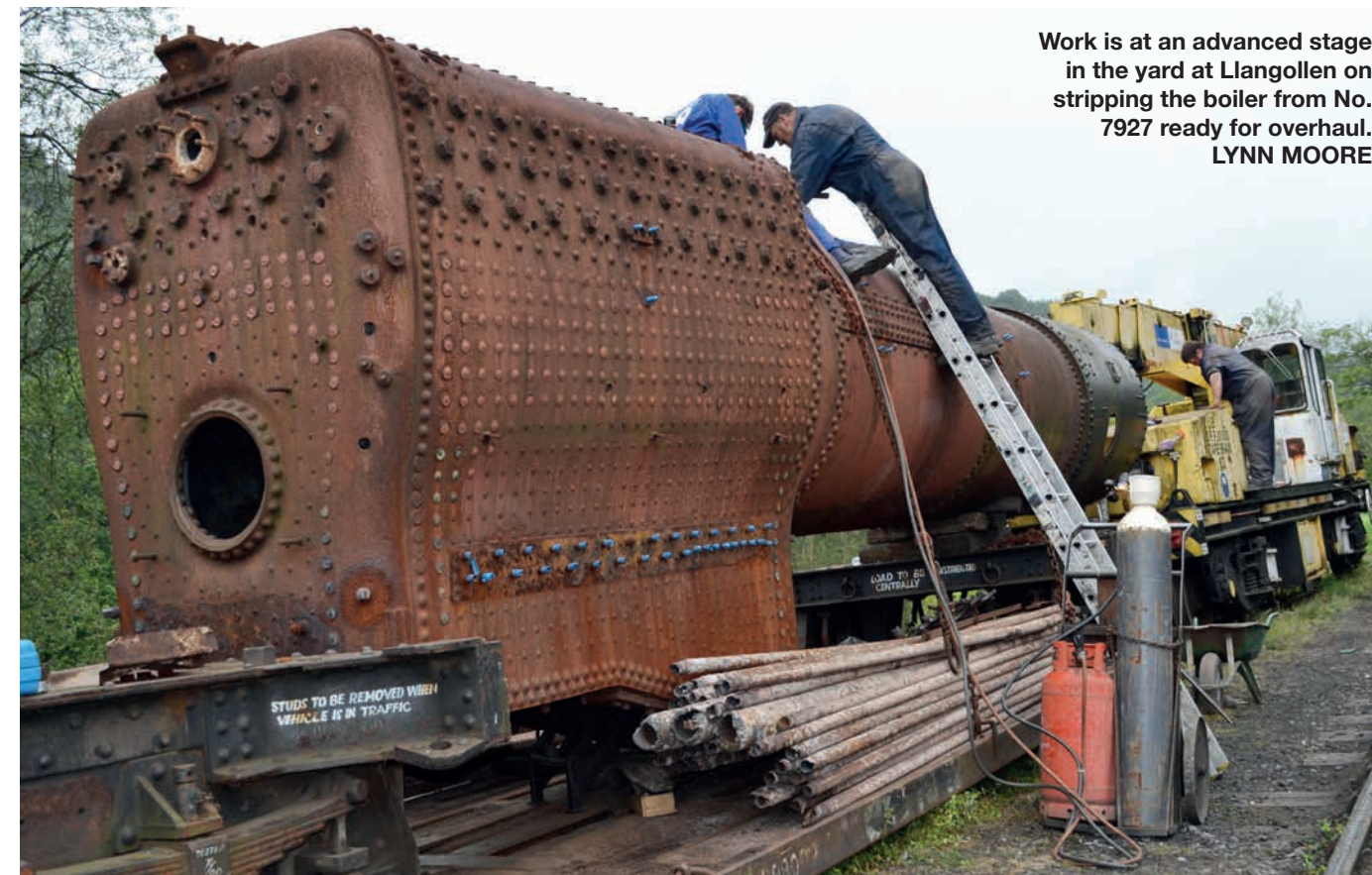
Work is at an advanced stage in the yard at Llangollen on stripping the boiler from No. 7927 ready for overhaul. LYNN MOORE

rod. I am pleased to say that delivery of the completed rod is now imminent.