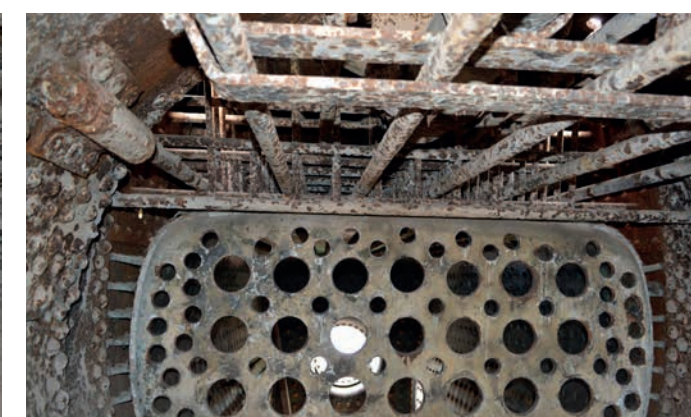
Two views showing the inside of No. 7927's boiler after the tubes had all been removed. LYNN MOORE