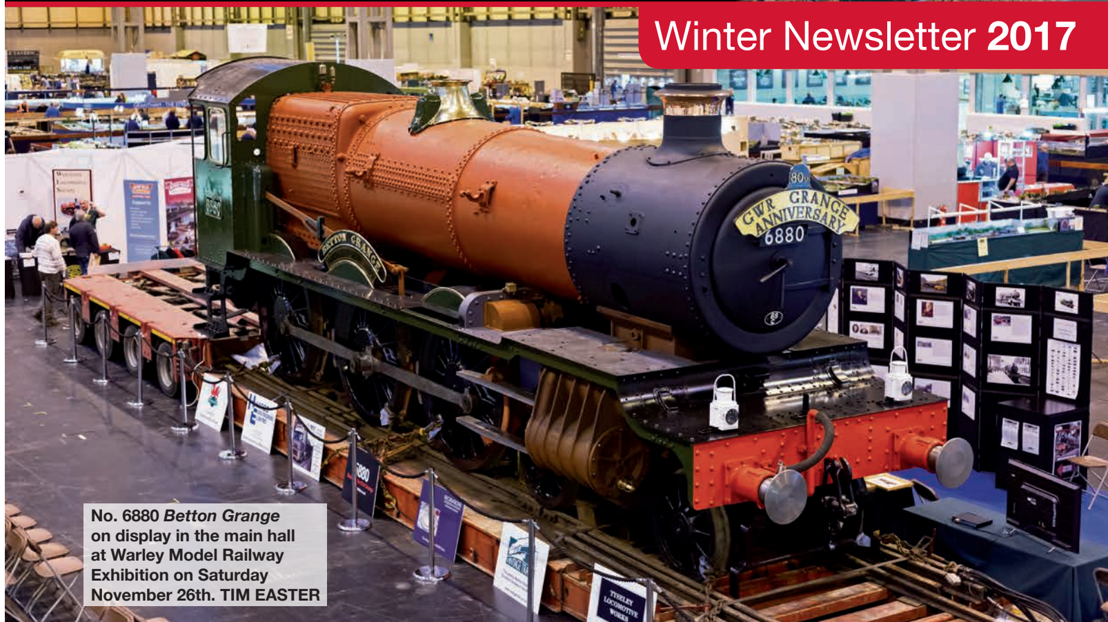
No. 6880 Betton Grange on display in the main hall at Warley Model Railway Exhibition on Saturday November 26th. TIM EASTER