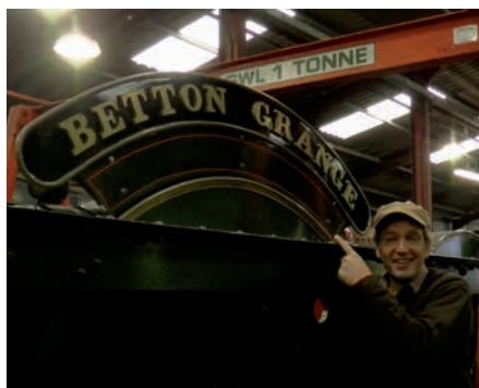
The 6880 Betton Grange Society's new Ambassador, TV personality Mark Evans inspects the loco inside the shed at Llangollen during October.