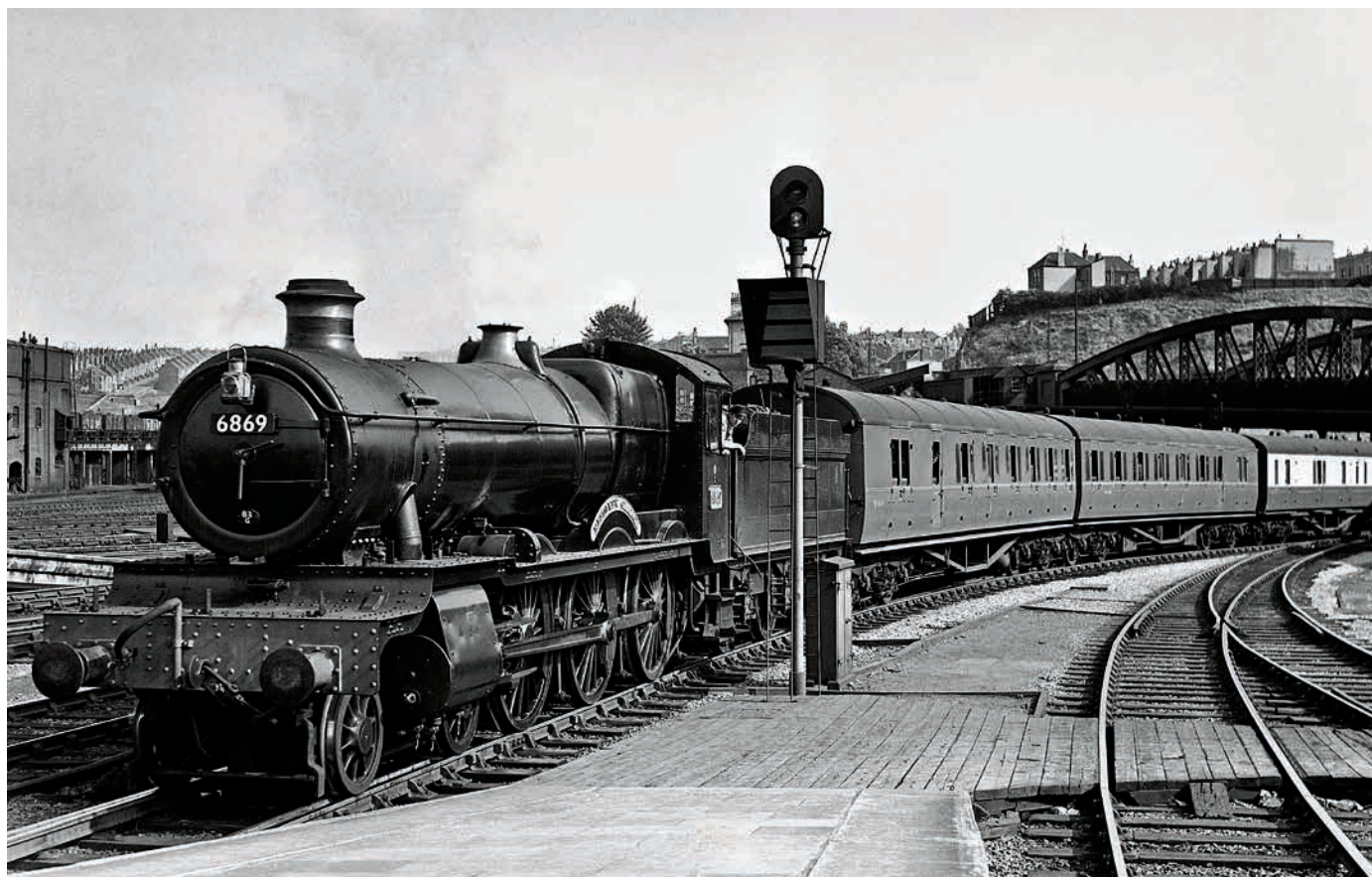
In contrast to the picture opposite, this view of No. 6869 Resolven Grange was taken in 1951, and shows the loco entering Bristol Temple Meads with an Up stopping train, wearing plain BR black livery with red backed number and name plates, together with a Penzance shed plate.