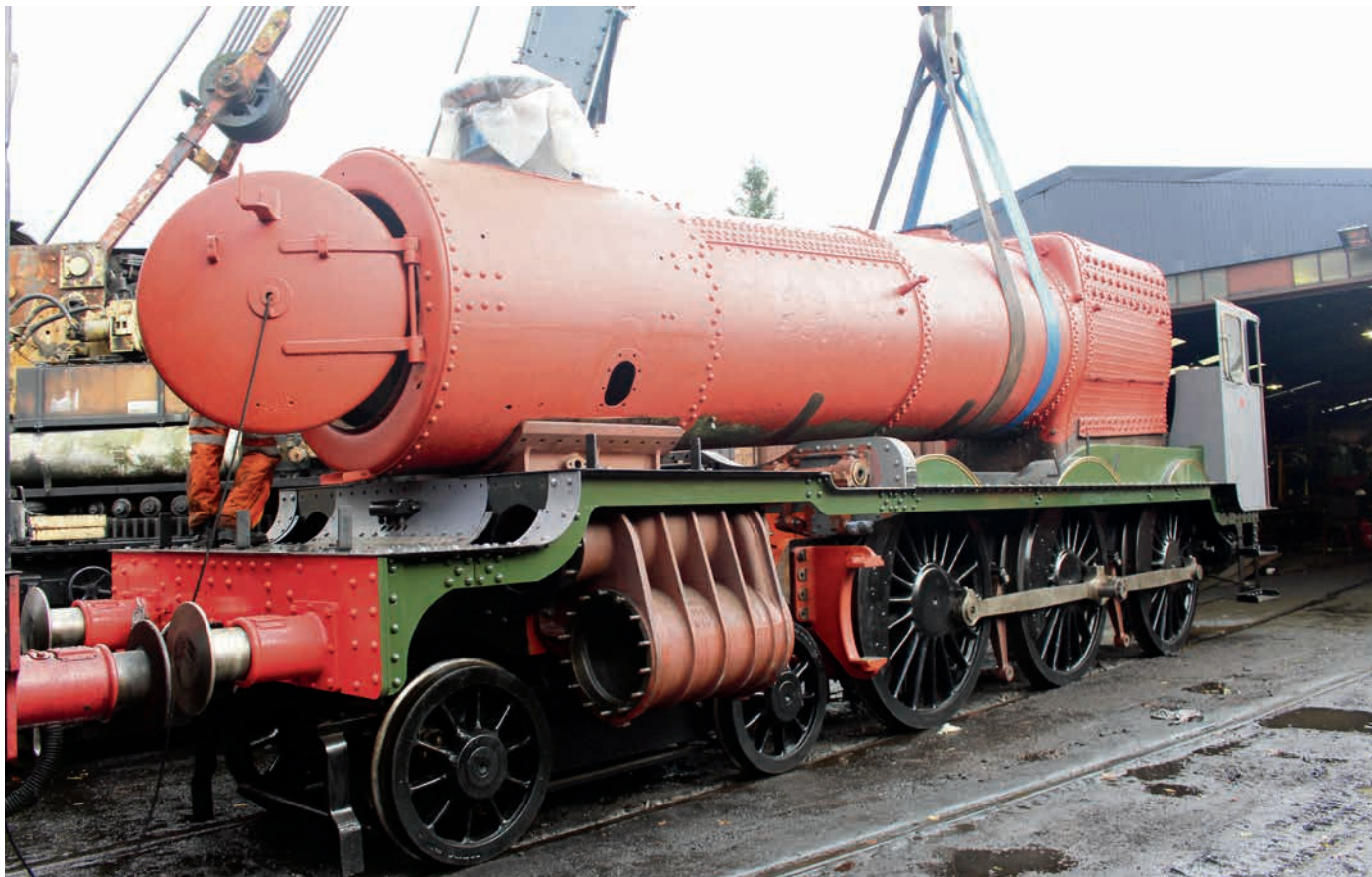
The moment No. 6880 started to look like a true 'Grange' – the Swindon No. 1 boiler from No. 5952 is lowered into the frames in early November. QUENTIN MCGUINNESS