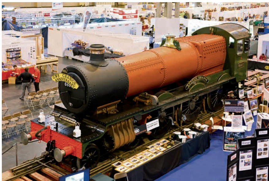
Part of the large sales and display area that was built alongside Betton Grange at the NEC for the Warley Model Railway Exhibition, where No. 6880 was a central feature for around 15,000 visitors over the two days. Seen after the public had gone home on the Saturday.

6880 Society members were also invited to come to the show free as part of our annual autumn Members' Day and more than 50 of you took up the opportunity. It was great to meet so many of our members on the stand. All in all, it was a great flag waving opportunity and a real morale booster for our group – well done everybody!