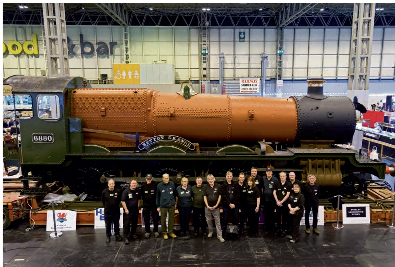
At the end of a busy Saturday at the Warley show, members of the team (not all were available) pose alongside No. 6880 Betton Grange , in this elevated view taken using an ingenious homemade telescopic pole

Each of the Directors took on a specific