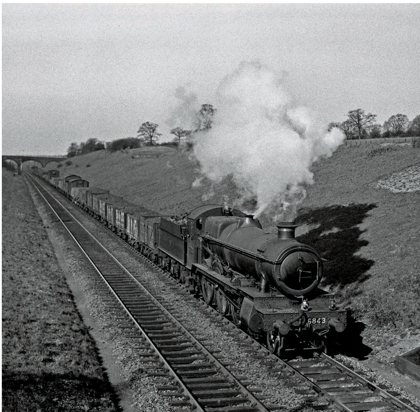
An early view of a 'Grange' in action, as No. 6843 Poulton Grange takes a long mixed goods past Denham on the Great Western/Great Central joint line in 1938.