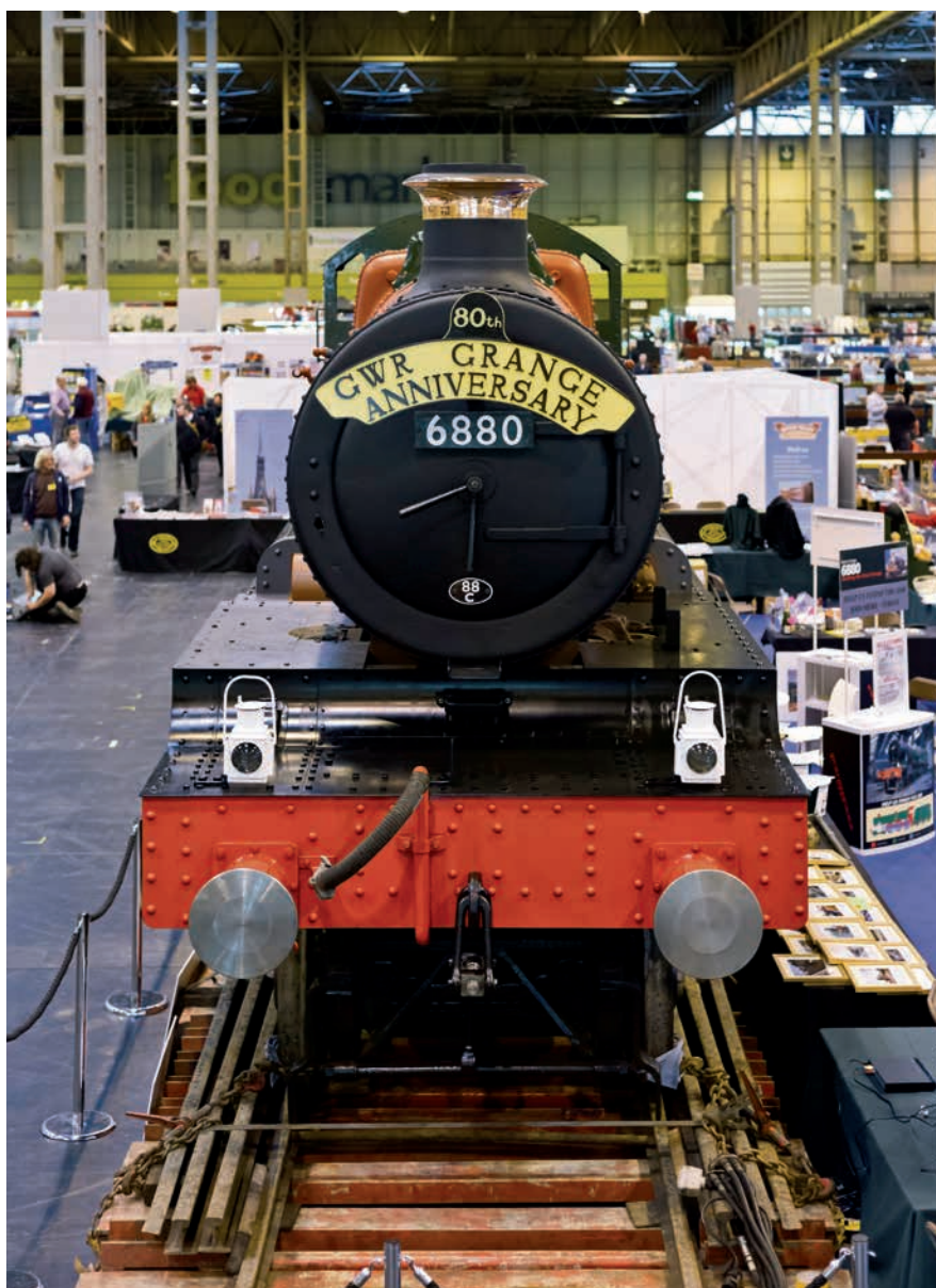
The imposing front end of No. 6880 seen on Saturday November 26th at Warley show, complete with 80th Anniversary headboard. TIM EASTER