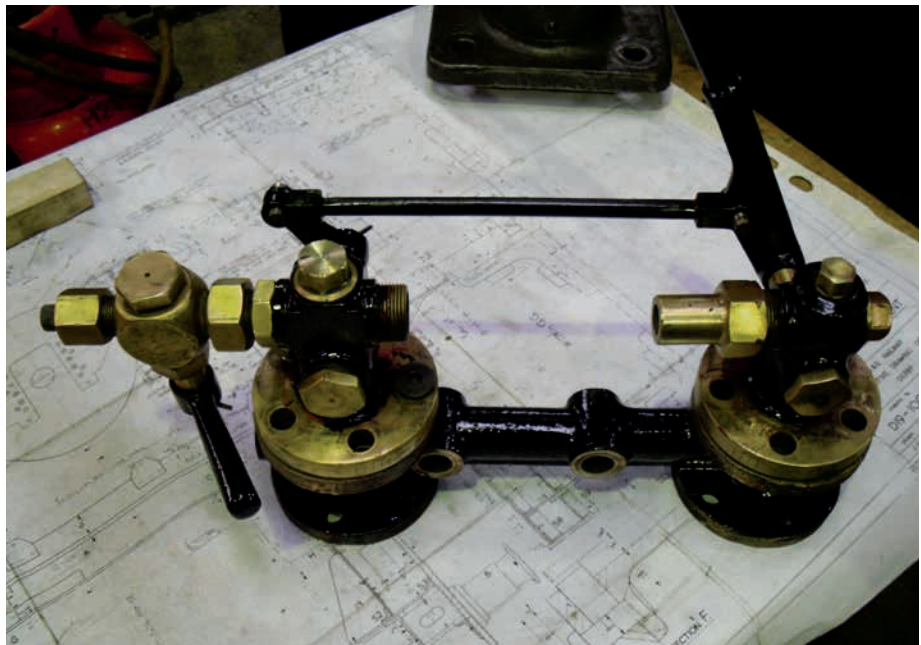
The new boiler water gauge frame seen in the workshops at Llangollen in October. This was one of the components taken to Warley for display. MICK PRIOR